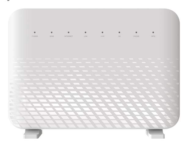
Table 4-1 describes the indicators on the front panel of the ZXHN H6645P unit.