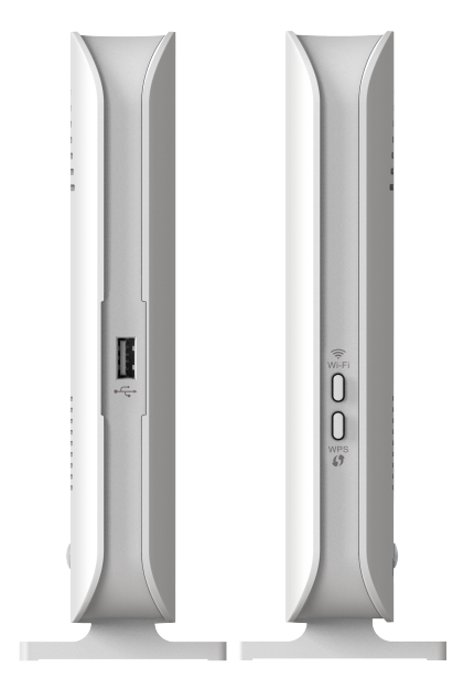
Table 4-2 describes the buttons and interfaces on the side panel of the ZXHN H6645P.