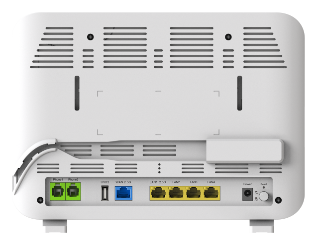
Figure 4-3 The Rear Panel

Table 4-3 describes the interfaces and buttons on the rear panel of the ZXHN H6645P.